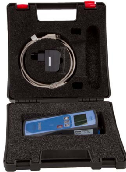
Figure 1: Standard accessories