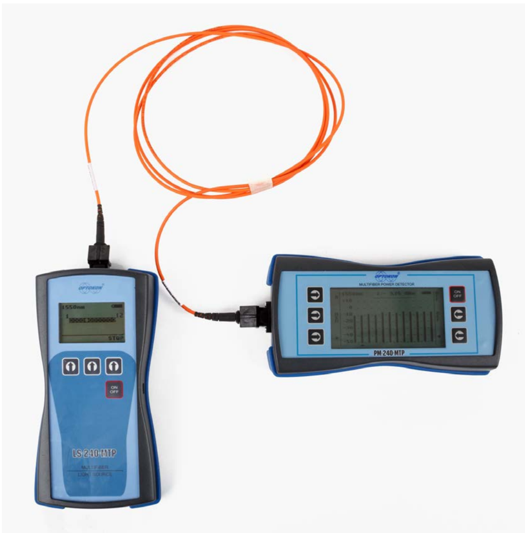
Figure 2: Example of measuring with LS-240-MTP and PM-240-MTP